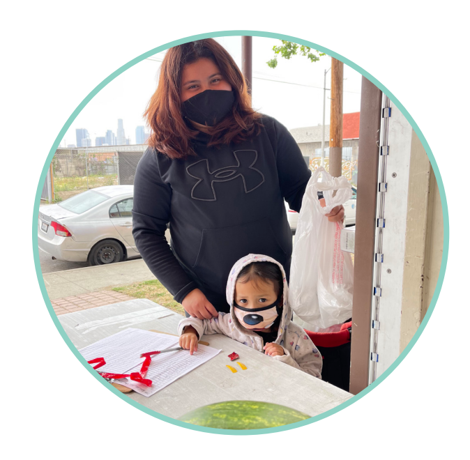
600 families reached per week with food