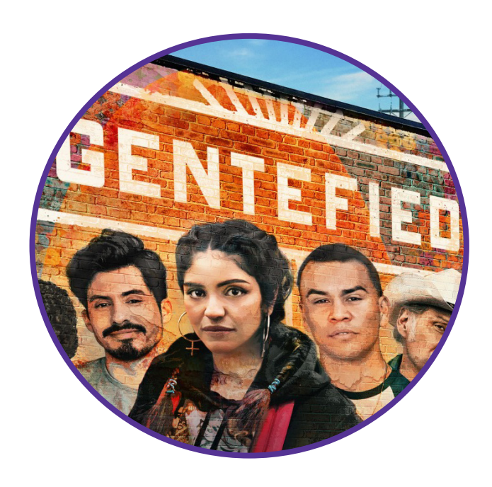
$65,000 raised through virtual table read featuring the cast of Gentefied and George Lopez