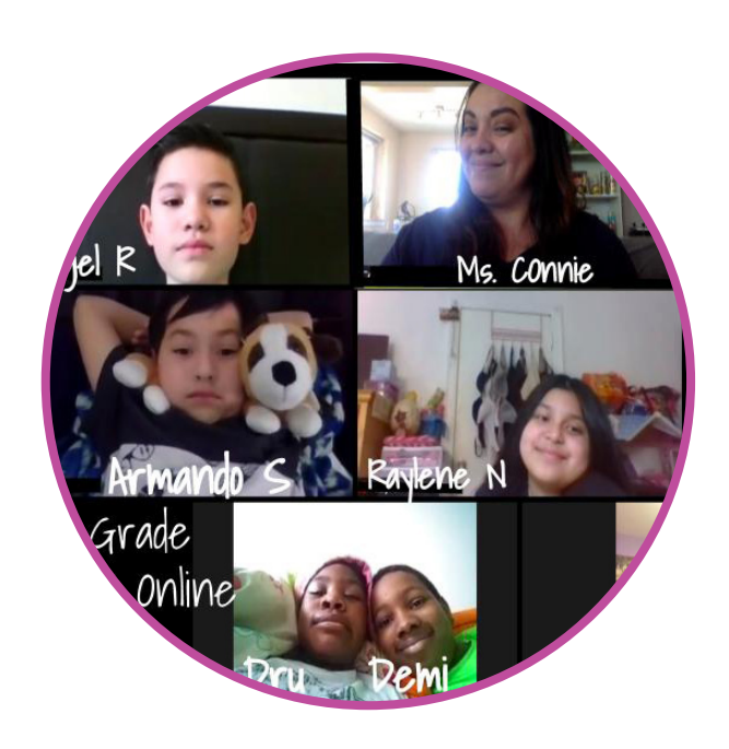
250 youth reached with virtual supports