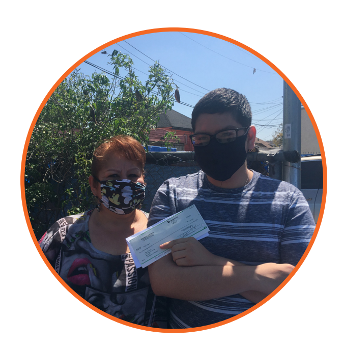
$400,000+ distributed in cash and voucher relief to Boyle Heights families