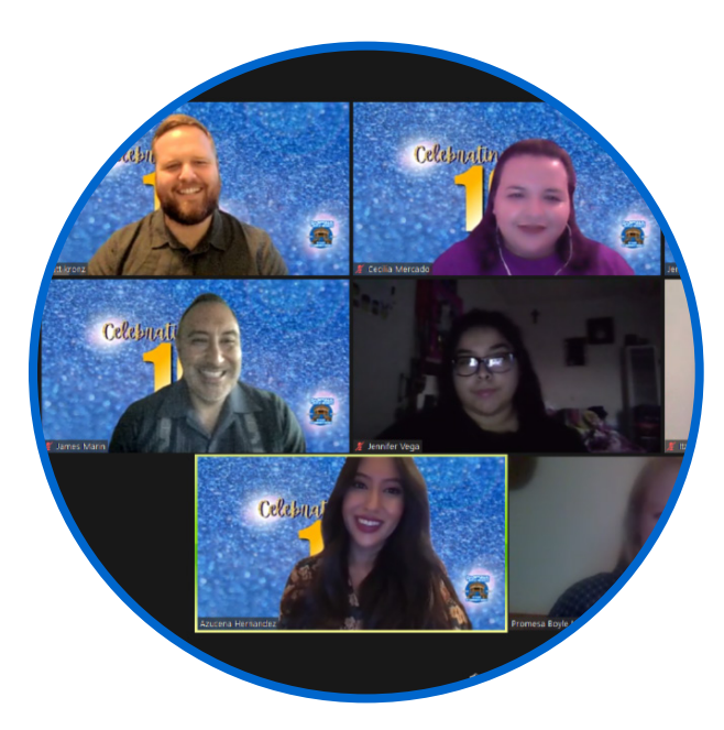
Promesa Boyle Heights celebrated 10 years of impact